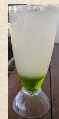
Melon Squash $5.5