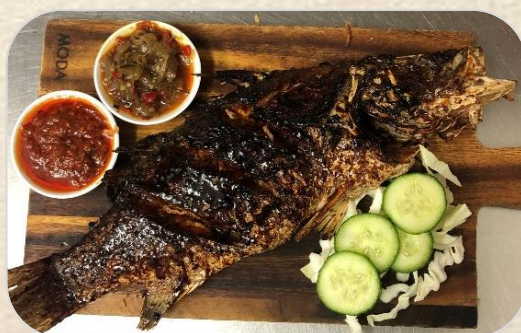
Ikan bakar barramundi