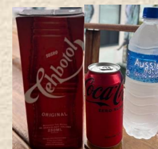
Teh botol/Softdrink/ water bottle $3