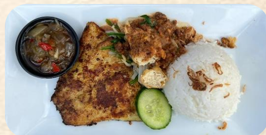
Ikan bakar bali

Deep fried whole barramundi fish served with two sambals and salad $40