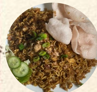
Nasi goreng mie