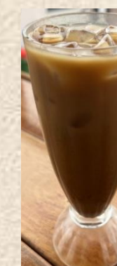
Es Kopi (iced coffee)$5 Hot Kopi (hot coffee)$4