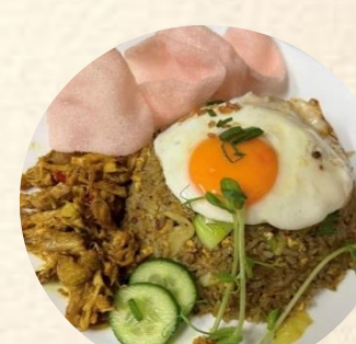
Nasi goreng bali