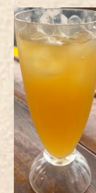
Es Lemon Tea $5