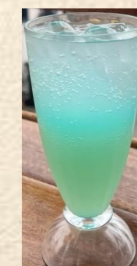
Lemon Squash $5.5