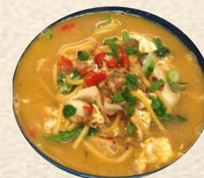
Mie rebus jawa

Deep fried tahu, wonton, fried bakso, beef ball served with sambal $18