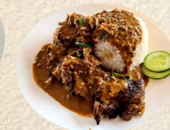
Iga bakar saus kacang