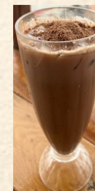
Es Milo/Hot Milo $5.5