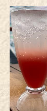
Es Lemon Ribena (Ribena+Lemon+Soda) $5.5