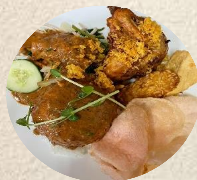
Nasi pecel ayam

Nasi Pecel+Paru (crispy beef lung) $18.9