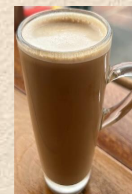
Es teh tarik (iced milk tea)/ teh tarik panas (hot) $5.5