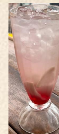
Es Kelapa muda (young coconut+syrup) $5.5