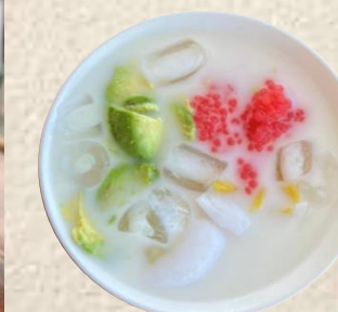
Es Teler $8.5