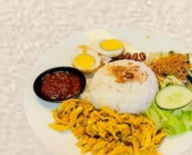
Nasi campur bali