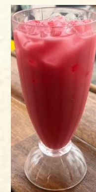
Es bandung/Soda gembira (water/soda+rose syrup+milk) $5,5