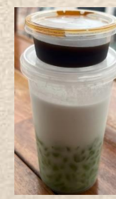
Es Cendol $7