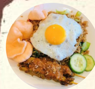
Nasi goreng sate