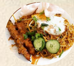
Mie goreng sate

Fried kwetiau mixed with seafood egg & bean sprout $17.9