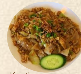
Kwetiau goreng jawa