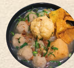
Bakso komplit malang