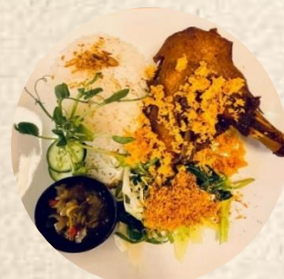
Bebek goreng bali

Crispy fried duck served with rice, vegies in coconut dressing and Balinese sambal matah $18.9