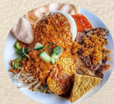
Nasi pecel empal