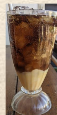
Es Mega Mendung (Milk+Coke) $5.5