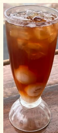
Es Lychee Tea $5.5