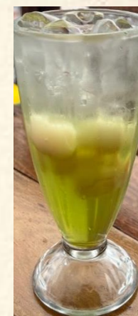
Es Lychee syrup $5.5