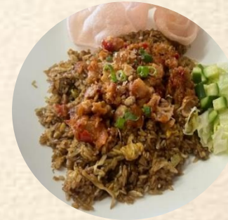
Nasi goreng geprek