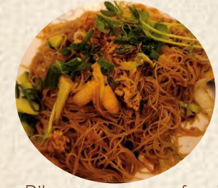
Bihun goreng seafood