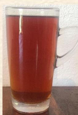
Es teh tawar/manis(iced tea)$5 Teh tawar/manis panas(hot tea)$4