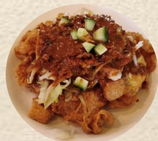
Tahu telur goreng

Deep fried eggplant served with sambal $7.5