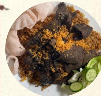
Nasi goreng paru