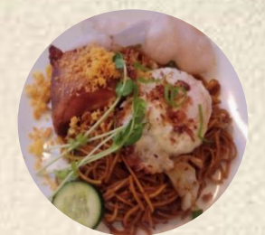
Mie goreng ayam