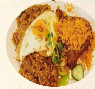
Nasi goreng ayam kremes