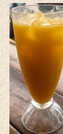
Orange OR Apple Juice $5.5