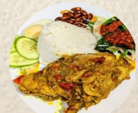
Bebek betutu bali